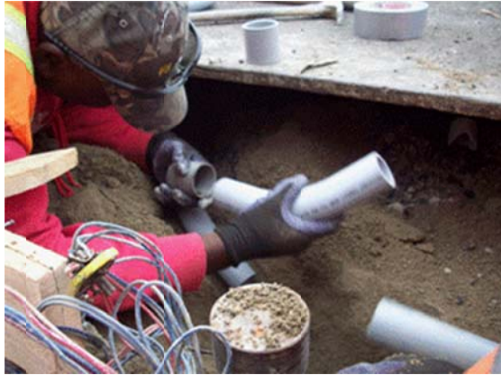
Conduit Repair at Cutting and Canal Boulevards

Parks and Landscaping Division : Crews are continuing with the Burg Park construction; landscape maintenance was completed at May Valley Community Center and John F. Kennedy Park; crews also performed Esplanade tree replacement in the Marina Bay area, completed vegetation management at Hilltop Lake Park, landscape maintenance on Hilltop Drive, and irrigation repairs at various parks.