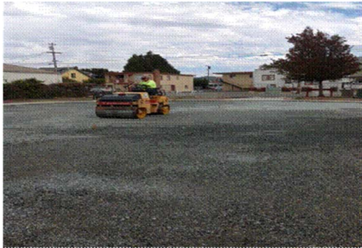
Burg Park Construction

Parks and Landscaping Division : Crews are continuing with the Burg Park construction; landscape maintenance was completed at May Valley Community Center and John F. Kennedy Park; crews also performed Esplanade tree replacement in the Marina Bay area, completed vegetation management at Hilltop Lake Park, landscape maintenance on Hilltop Drive, and irrigation repairs at various parks.