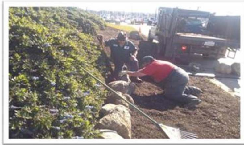
Landscaping along the Esplanade Trail

Civic Center and at Tiller, Burg, Solano, and Mira Vista parks. Crews have almost completed the directional sign project in the Hilltop Assessment District.