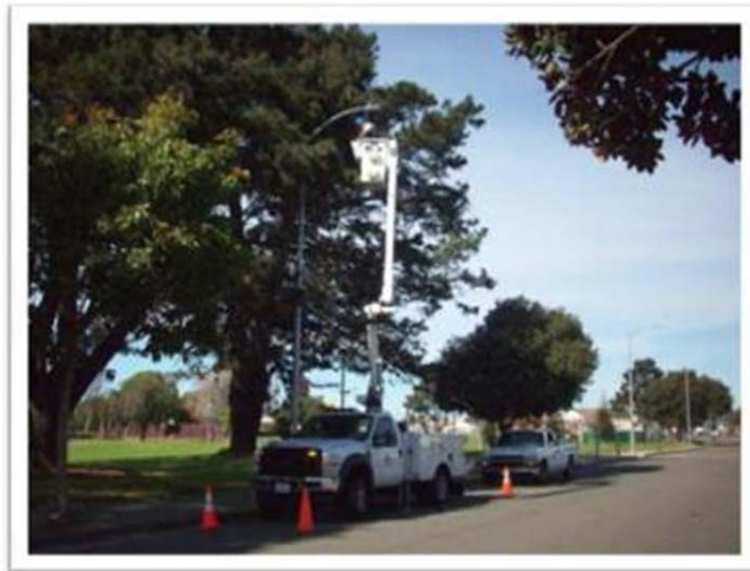
Electricians repairing a street light at John F. Kennedy Park

Electricians replaced 17 ballasts and lamps on docks "C" and "E" in the Richmond Marina, completed the Fairmede street light pole condition survey, replaced non-operating breakers at the Richmond Art Center, repaired the street light fixture at John F. Kennedy Park, and replaced the breaker for the street light circuits.