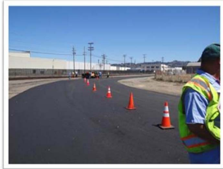
Paving on Regatta Boulevard

Street sweeping performed commercial and residential sweeping services for the fourth Monday through Wednesday and fifth Thursday and Friday in Santa Fe, Point Richmond, Marina Bay, Coronado, Metro Richmore Village, Pullman, Cortez/Stege, Park Plaza Laurel Park and City Center neighborhood council areas.