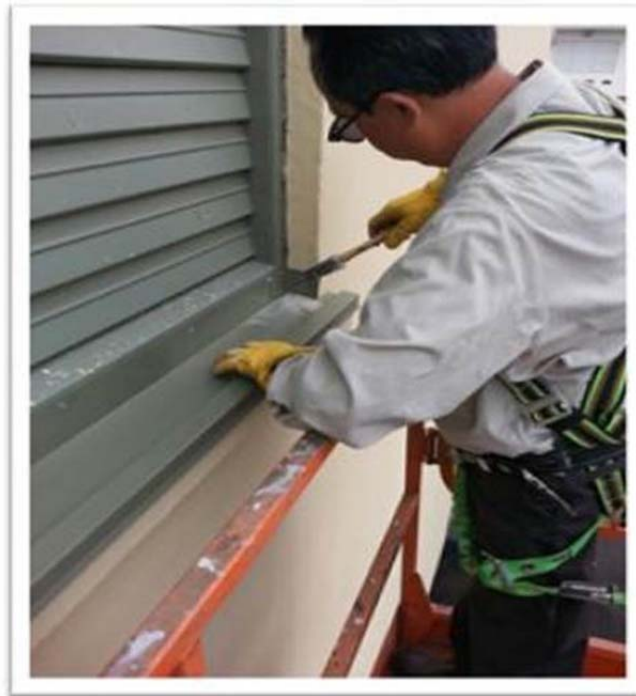
Installation of Storm Vents

Facilities Maintenance: Carpenters repaired the south wall of the Richmond Recreation Complex gym, installed storm vents and repaired the storefront entrances and three windows at the Recreation Complex, repaired doors at Shields Reid Community Center, and installed bollards in the Corporation Yard.