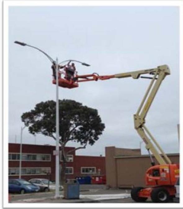
Painting of Poles at Employment and Training

Stationary Engineers cleared waste lines at the Senior Center, Recreation Complex and Fire Station #64, serviced the furnace at the Senior Annex Center and in the Point Richmond Community Center, repaired the air conditioner at 440 Civic Center Plaza, and sealed former waste lines at the Shields Reid Community Center.