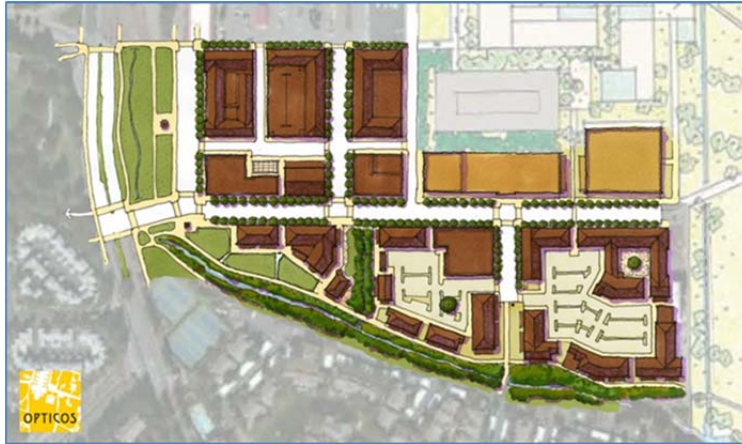
Concept Design for Lark Street near Regatta Boulevard and Marina Bay Parkway Intersection

This past Wednesday, August 28 th , the Richmond Planning Division held a community meeting to obtain input on the three development alternatives that have been prepared for further analysis under the South Shoreline Specific Plan. The alternatives discussed would accommodate 3 to 5 million square feet of new employment space and 900 to 7,000 new residential units in the areas surrounding the proposed Lawrence Berkeley National Lab (LBNL)/UC Berkeley Richmond Bay Campus. A summary and full analysis of the alternatives is being prepared and will be available for public review and comment in December 2013. Over 50 people attended the community meeting, representing area residents, businesses, and property owners, and expressed their views on future land uses, transportation, open space, and environmental clean-up in the area.