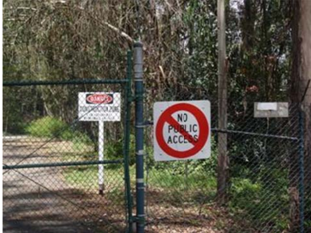
Pt. Molate – No Public Access Signs

The street sweepers' regularly scheduled commercial and residential routes for the first Monday through Thursday and the second Friday are Parchester Village, Hilltop Bayview, Hilltop Green, Fairmede/Hilltop, Carriage Hills, El Sobrante Hills, Greenbriar, Hasford Heights, Via Verde, San Pablo Dam Road, Bristol Cone, Clinton Hill and East Richmond Neighborhood Council areas.