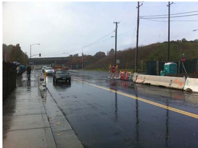
El Portal Drive Road Opening: El Portal Drive is open to through traffic.