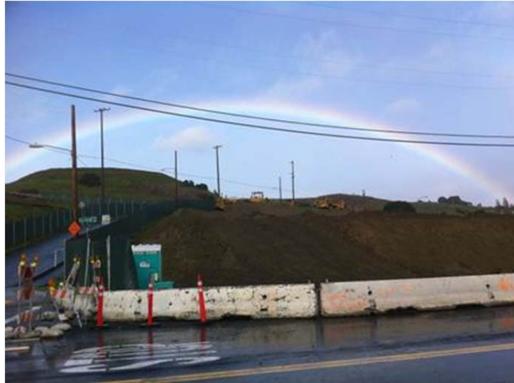
El Portal Drive Rainbow: A rainbow is visible from El Portal Drive at the time of the road opening, confirming this was an auspicious time to reopen El Portal Drive to through traffic.

As you may recall, El Portal Drive has been closed to through traffic in the vicinity of I-80 as part of the Via Verde sinkhole repair. This past Friday, December 21 st , El Portal Drive was reopened to traffic as a partial-width road opening, with one travel lane in each direction. The north side of El Portal Drive will remain closed until the remaining project tasks are completed, including utility installation, Via Verdi roadway reconstruction, removal of the temporary bypass road, and restoration of the Rolling Hills Memorial Park property.